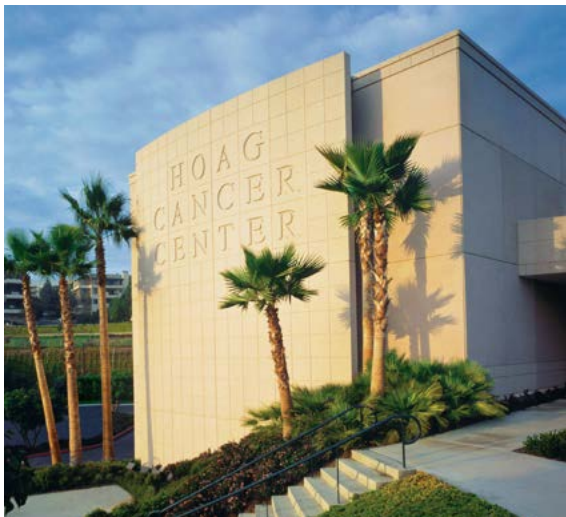
Hoag Family Cancer Institute One Hoag Drive, Newport Beach, CA 92663